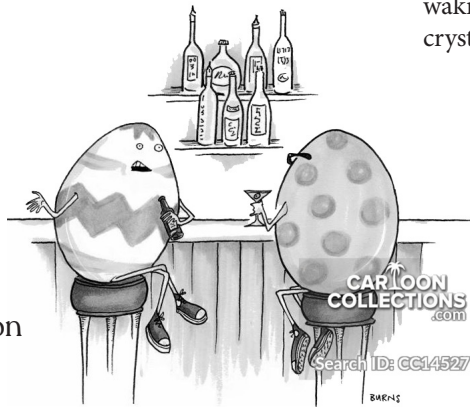
"What I don't get is how one minute we're a symbol of new life and the next minute we're a sandwich."